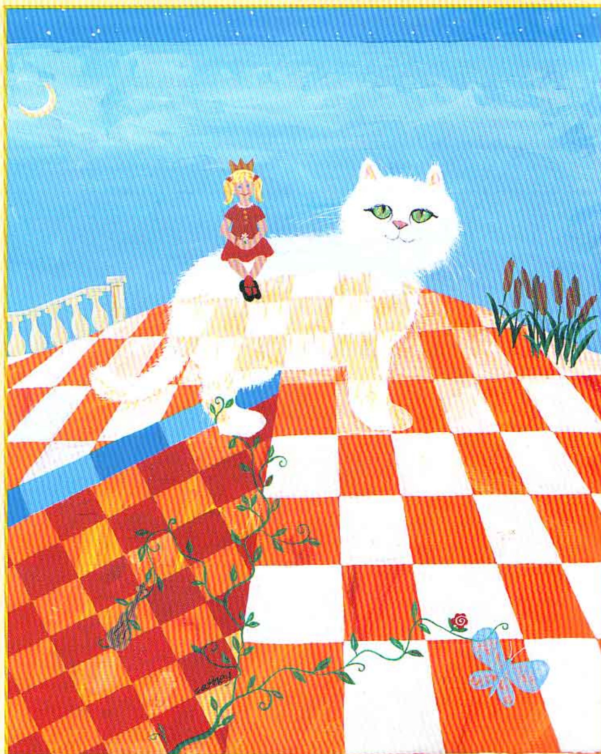
"I've Been to London to See the Queen"

She is actively involved in the Vestavia Hills Art Association, the Hoover Art Association and the Shelby County Art Association.