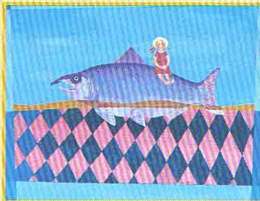
“Until My Ship Comes In”