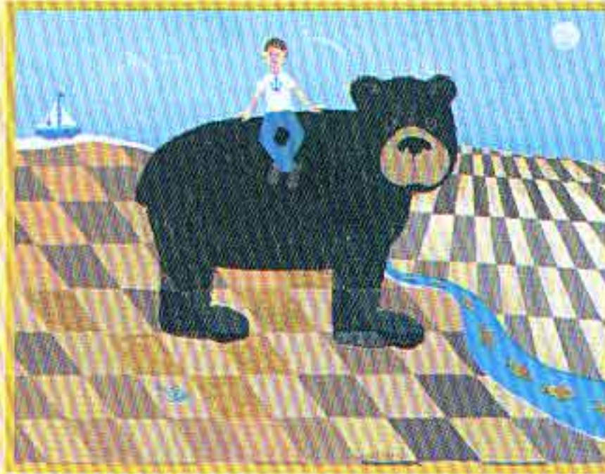
“Bear With Me”