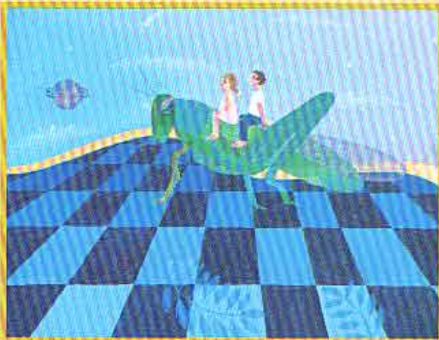
“This is not a Normal Day”